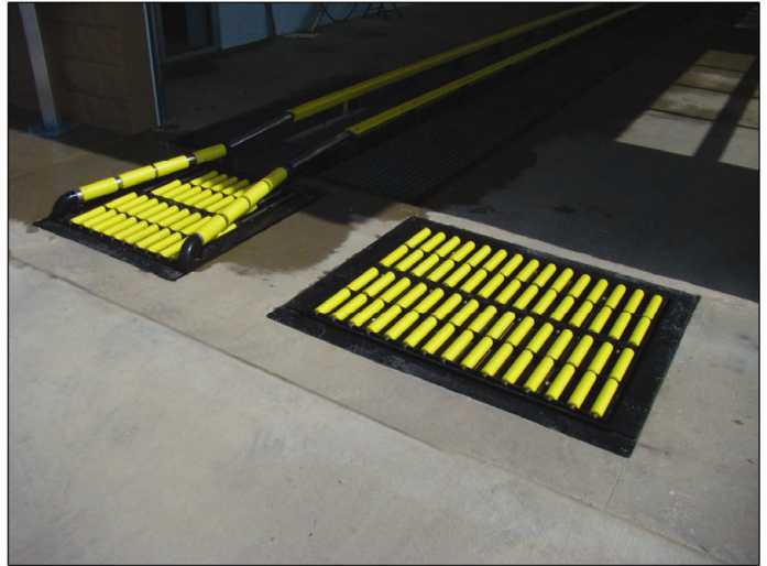
*Shown with optional Stainless Steel Y-Section

Passenger Side Correlator Length 31" Passenger Side Correlator Width 46"