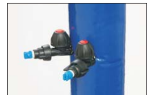
Shown with optional fittings.