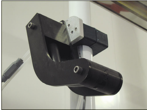
Single Foam Pods™