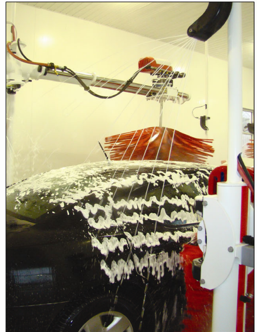
*Shown with Single Foam Pod™

Water Requirements 5 GPM fresh water feed (minimum) to 3/4" hose barb