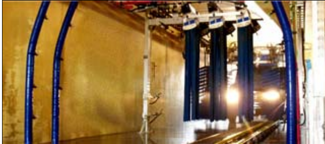
Star 95 Car Wash's Belanger® tunnel in action