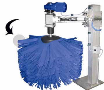
*Shown with Electric Drive and Waves & Fins™ cloth wash media